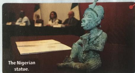
The Nigerian statue.

On 3 March, people in 14 of the 50 US states voted for the person they'd like to represent the Democratic Party in the presidential election in November. Whoever wins will take on Donald Trump. The day is known as Super Tuesday, because it is the biggest voting day for choosing a candidate. Just as The Week Junior went to press, Joe Biden, a former vice-president, had finished first in nine out of the 14 states.