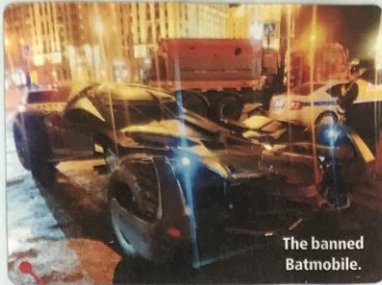
The banned Batmobile.