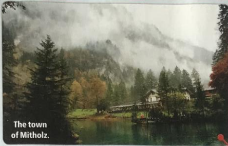
The town of Mitholz.