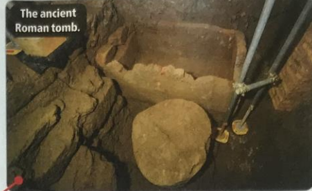
The ancient Roman tomb.

A Batmobile was stopped by police on the streets of Russia's capital, Moscow, on 22 February. The vehicle was pulled over because it was too wide for the city's streets and was not suitable to be driven on the road. The car – which was towed away – is thought to be a replica of the Batmobile from the film Batman v Superman: Dawn of Justice . The driver was a 32-year-old man who has not been named.