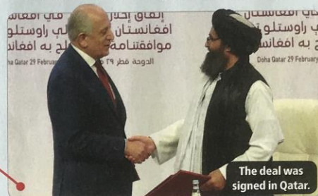
The deal was signed in Qatar.

Historians can't agree whether a tomb found in an ancient temple belonged to Romulus. In Roman mythology, Romulus founded the city of Rome on the Palatine Hill in 753BC, after killing his twin brother Remus, and became its first king. Archaeologists discovered the 2,600-year-old tomb and carefully cleared out earth and rocks before revealing it to the public on 21 February. Historians in Rome are divided about whether the tomb really belongs to the legendary royal.